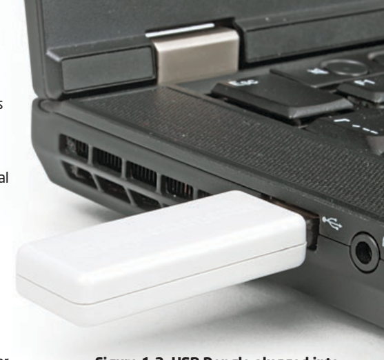
Figure 1-3: USB Dongle plugged into Laptop USB host connector

Yes. If you already have USB Dongle Licenses for other MikroElektronika software products, you can use them simoutaneously on a single computer. If your computer doesn't have enough USB host ports, you can use additional USB hub.