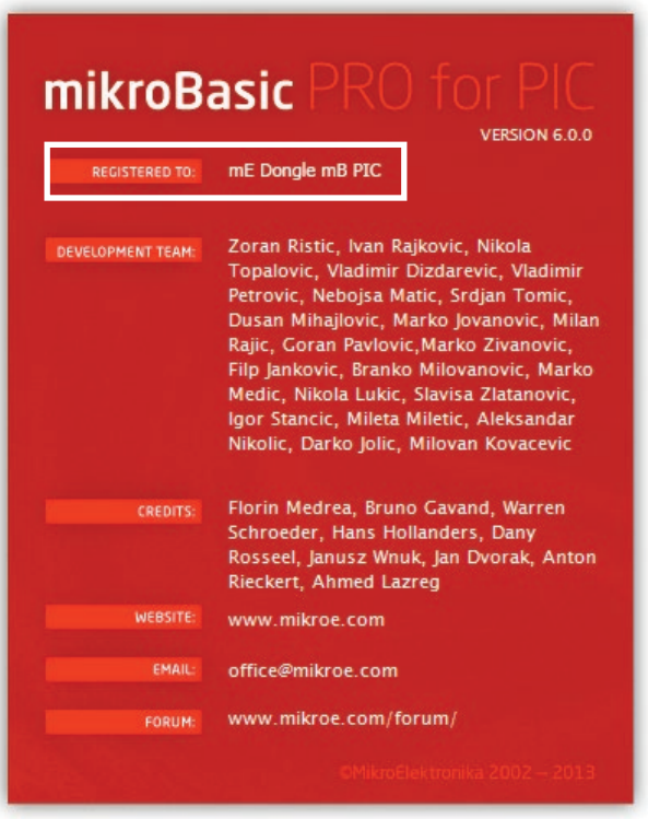
Figure 1-2: mikroBasic PRO for PIC® About Window